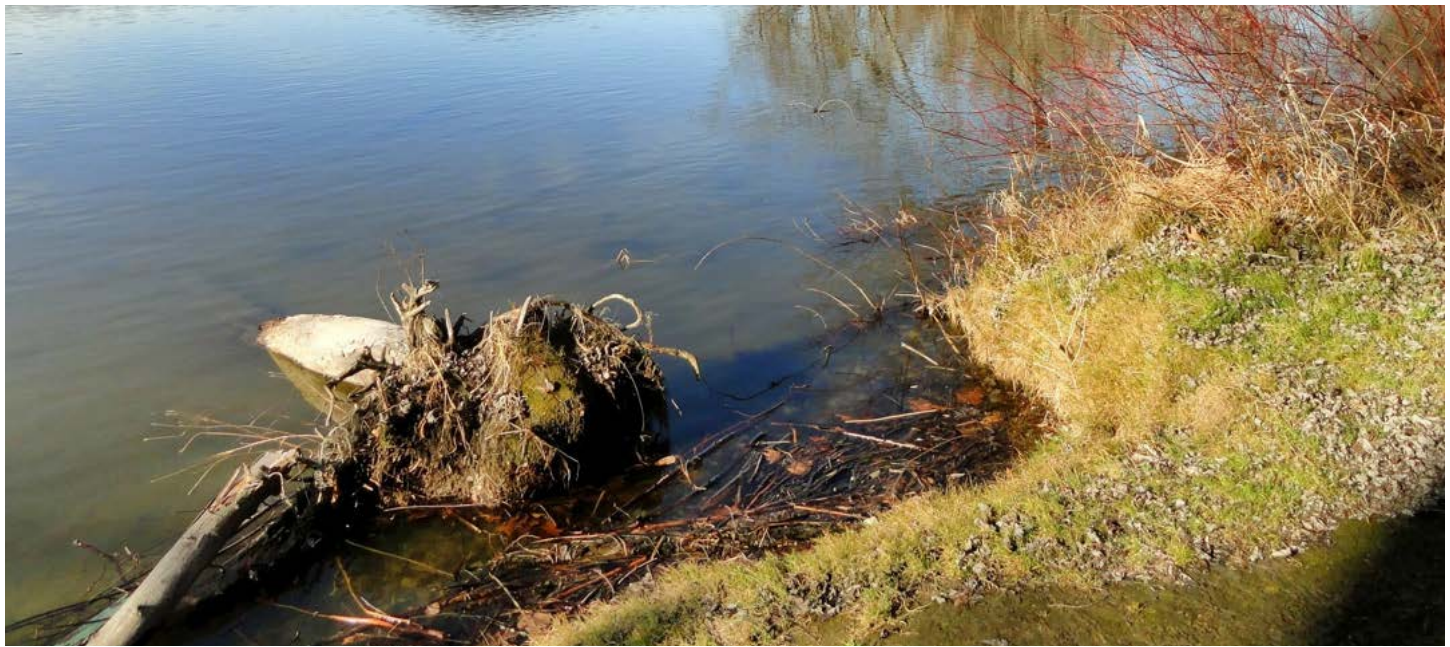
Final Investor Impact Report

A. We do not at this time. Because many projects are completed over the course of several years and may only be partially funded with green proceeds, attempting to tie impact to actual dollars spent is difficult. Quite a bit of impact information may be found for specific projects at the www.mass.gov website. Should you have specific or additional questions about a project, you can also contact us using the information provided on the back cover of this report.