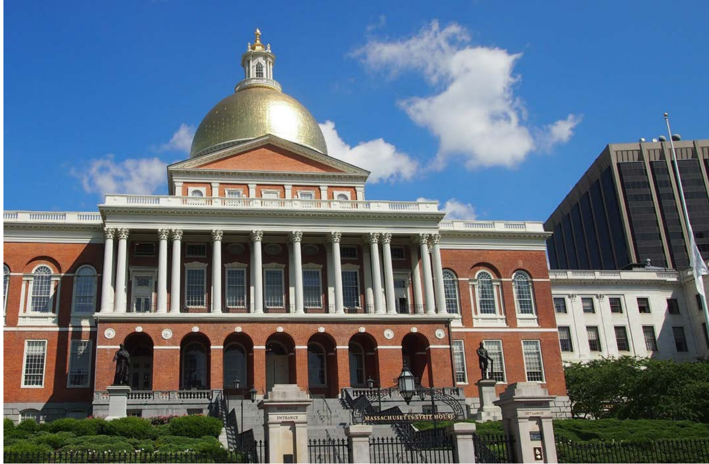
Final Investor Impact Report