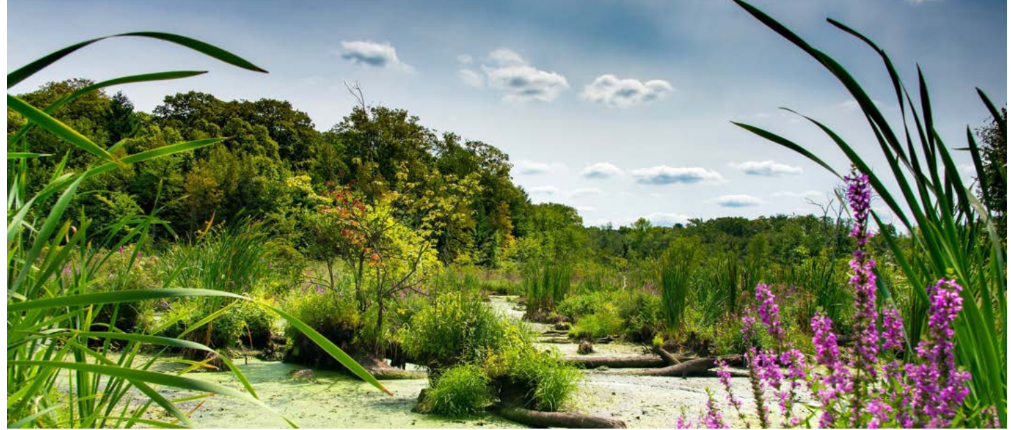
Final Investor Impact Report