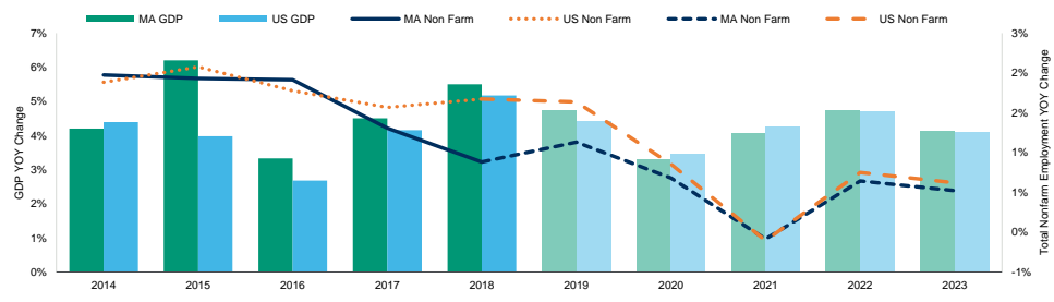
Exhibit 1 Strong annual GDP growth Year-over-year change in GDP and Non-Farm Employment for MA and US

*2019-2023 data are projections